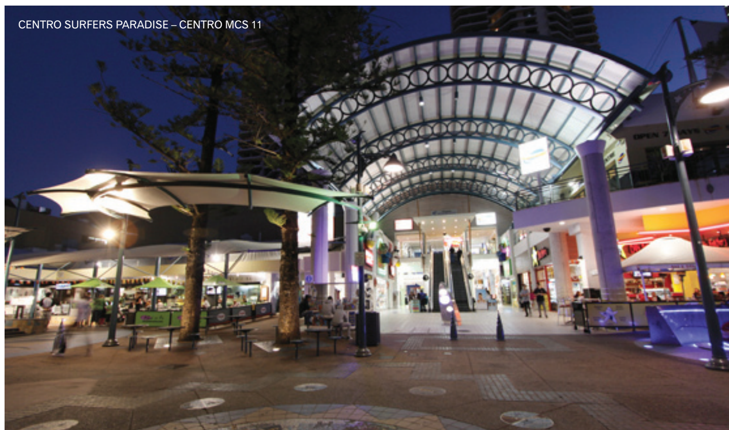
CENTRO SURFERS PARADISE – CENTRO MCS 11

The term of the trust expired on 14 June 2010. Earlier in 2010 the manager advised it intended to sell the properties. The properties were put on the market and expressions of interest were received, however to date, no sale has been consummated. The DPF awaits further advice on the progress on this fund's wind up. Capital distributions are not expected in the near future.